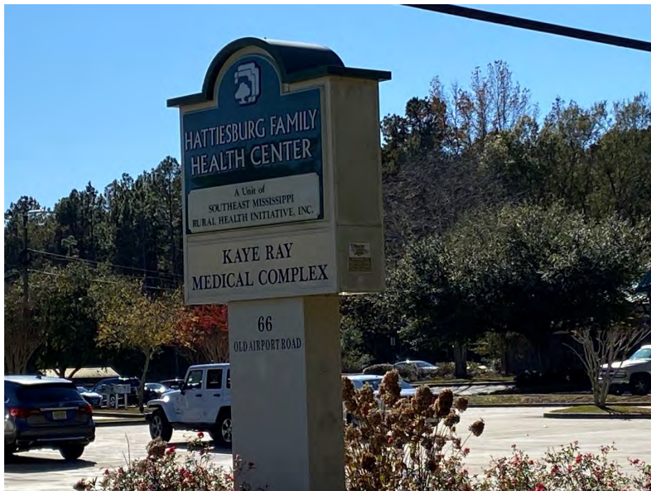
Photo 14: Sign on located at the northern entry to the Subject Property.