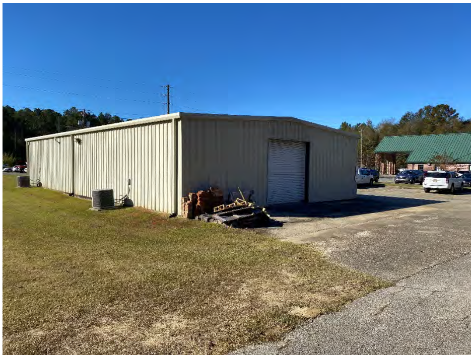
Photo 10 Support building on the eastern side of the Subject Property.