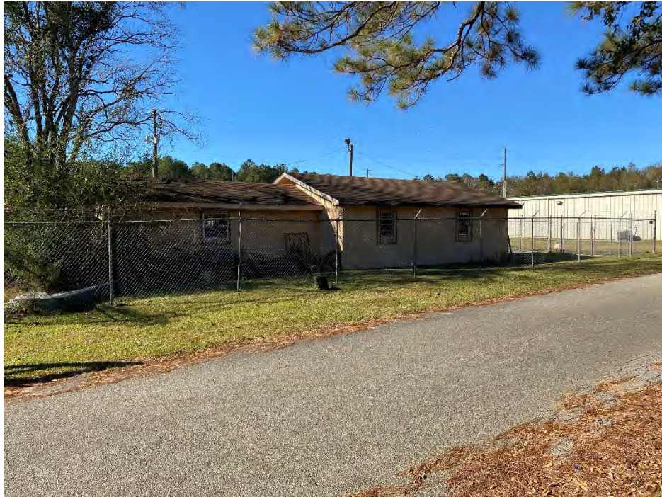
Photo 8: Support building on the eastern side of the Subject Property.