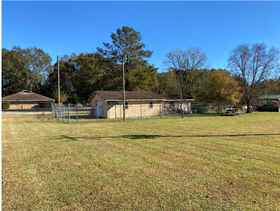
Photo 1: Support building on the eastern side of the Subject Property.