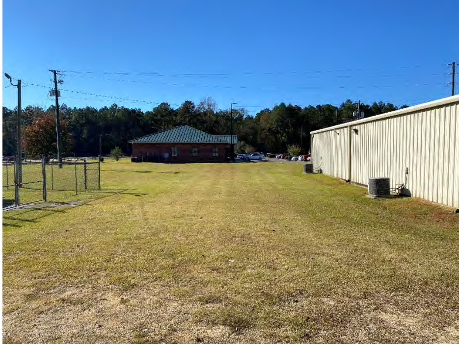
Photo 11: View of the main building on the Subject Property looking west.