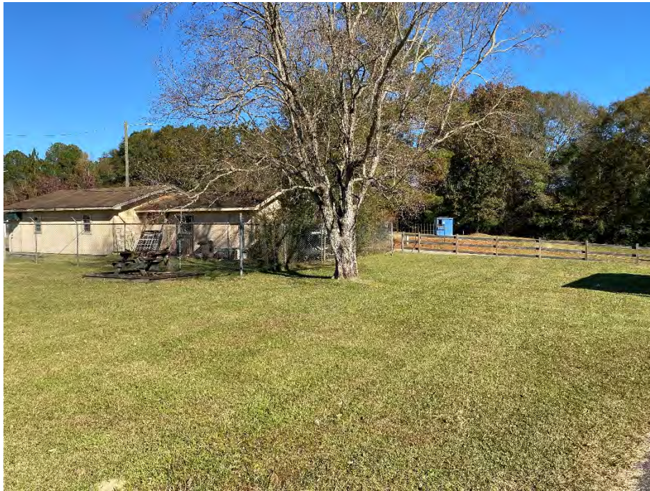
Photo 3: Support building on the eastern side of the Subject Property.