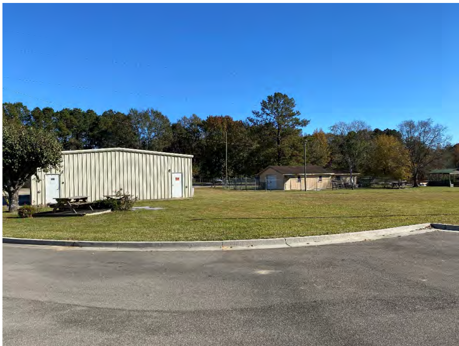
Photo 12: Support building on the eastern side of the Subject Property.