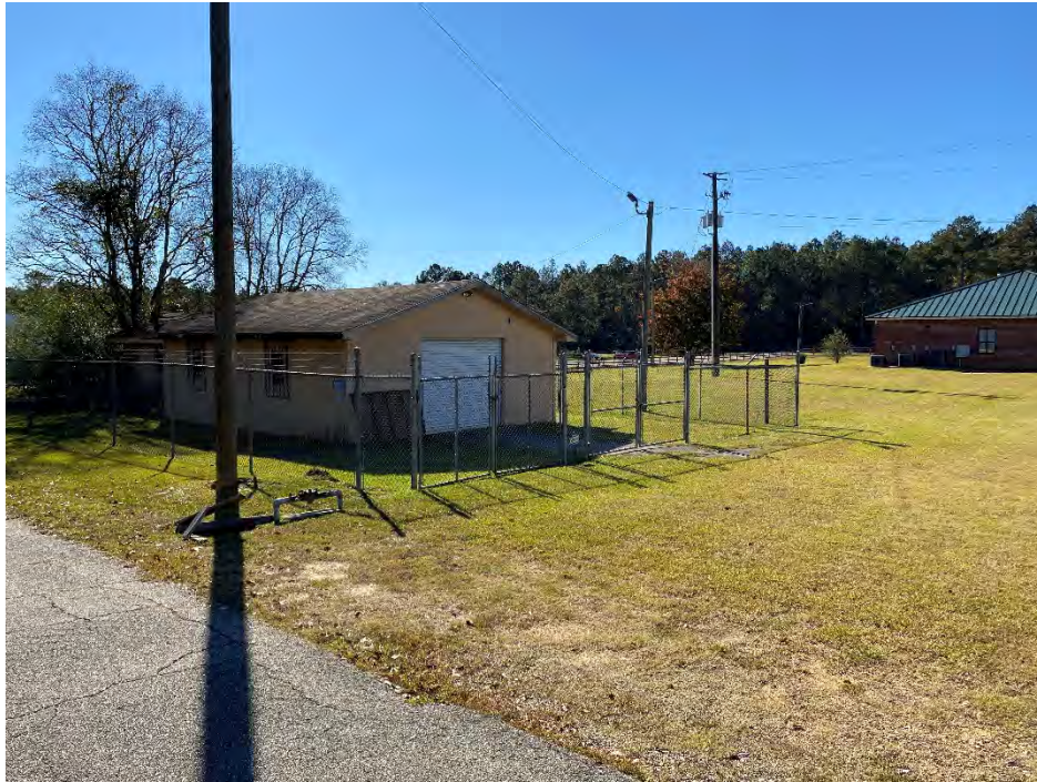
Photo 9: Support building on the eastern side of the Subject Property.